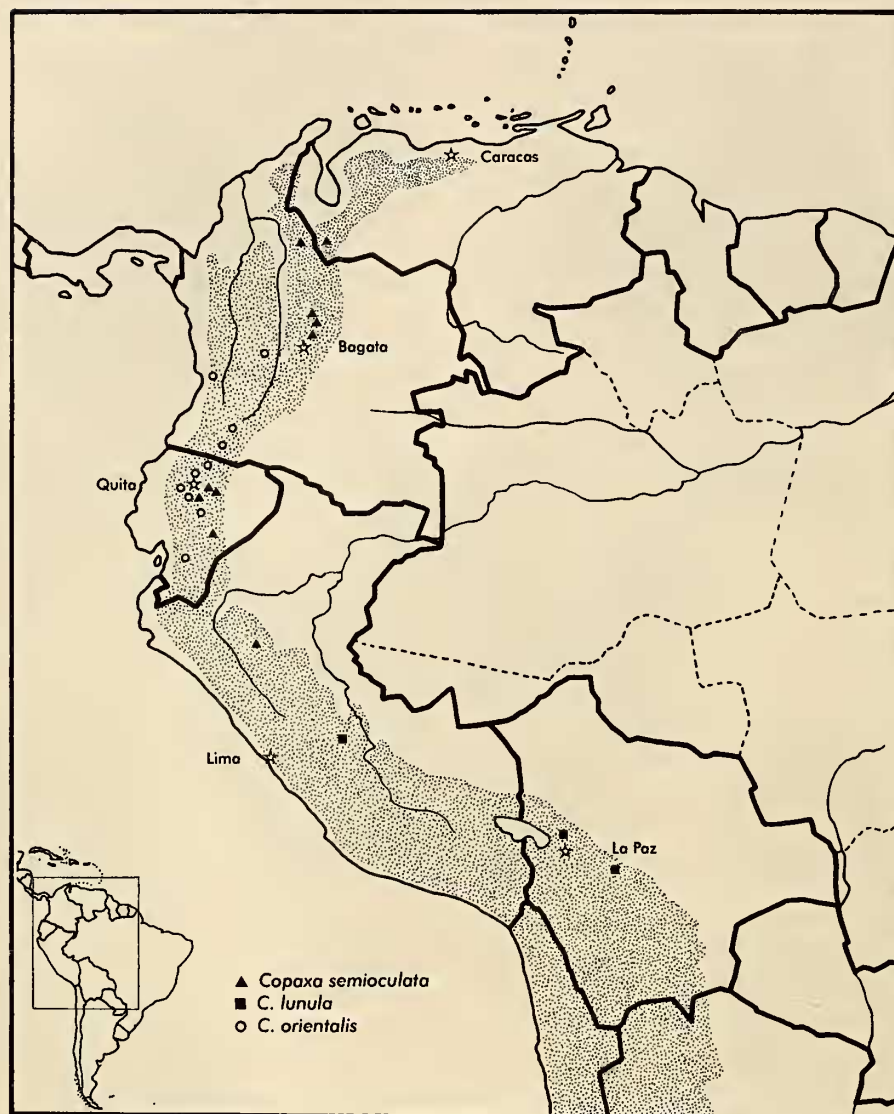
FIG. 22. Distribution map.

Thibaud Decaëns captured the first known female specimen in 1991 at 2615 m in mountains east of La Paz.